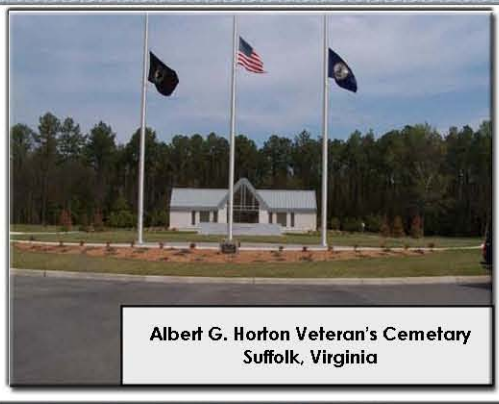
Albert G. Horton Veteran's Cemetary Suffolk, Virginia