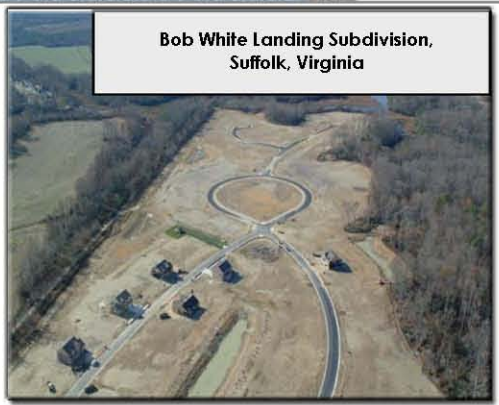
Bob White Landing Subdivision, Suffolk, Virginia

Hoggard-Eure Associates, pc 901 PortCentre Parkway, Suite 5 Portsmouth, Virginia 23704 Ph: 757.484.9670 Fax: 757.484.7498 Info@hoggard-eure.com