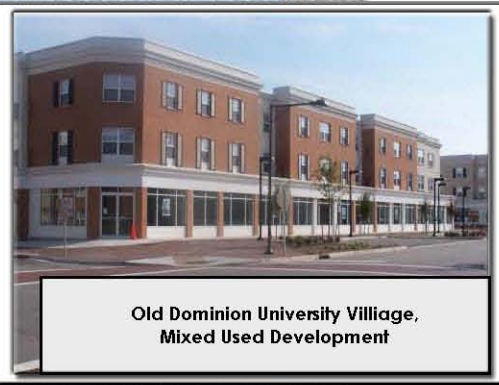
Old Dominion University Village, Mixed Used Development